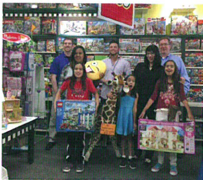
Aloha Construction Inc. organized a shopping spree for local children in need.

Not knowing what might come in subsequent days, the Dallas police force quickly called on all neighboring