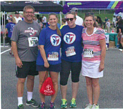
ATAS International Inc. employees participated in the Lehigh Valley 9/11 Heroes Run.

Four additional employees also participated in the inaugural Lehigh Valley 9/11 Heroes Run to benefit the Travis Manion Foundation, an organization for veterans and families. More than 250 runners, walkers and volunteers participated to raise $6,500 for the foundation. The money will be used to empower veterans and families of fallen heroes “to develop character in future generations.”