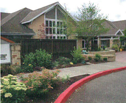
Columbia Construction Services Inc. worked with GAF and Allied Building Products Corp. to help a $1.4 million remodeling project at Ronald McDonald House Charities come to fruition.

Throughout November, DryHome Roofing and Siding