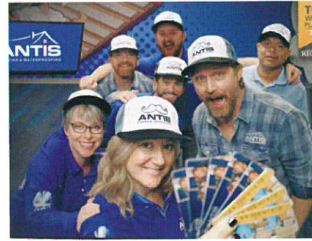
Antis Roofing and Waterproofing Inc. sent 2,000 Giving Cards to its community.

Antis Roofing and Waterproofing Inc., Irvine, Calif., has a history of giving back to its community and collaborating with Habitat for Humanity of Orange County, donating every roof system installation the organization needs.