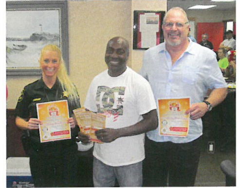
Every year, Advanced Roofing Inc. organizes holiday donation drives for Sonrise Mission. In 2016, it also organized a campaign to pay off the organization’s mortgage debt.